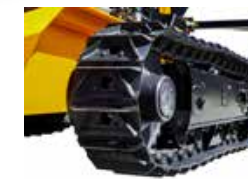
STEEL TRACKS (option)

Hydraulic variable track system with independent undercarriage frames and an automatic tensioning system built to work in the toughest conditions, thanks to a rubber tracks structure, oscillating roller system and triple-flange idlers.